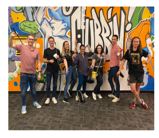
Celebrating the submission of our paper at ParTEE Shack!